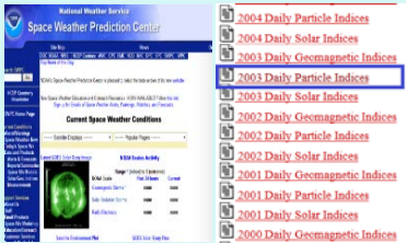
Figure 1. GOES data from [1]

1. Determination of solar proton integral spectrum during the event